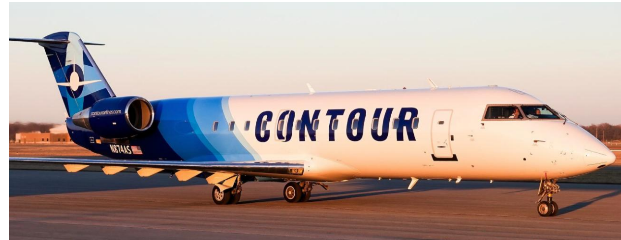
Bombardier CRJ Aircraft