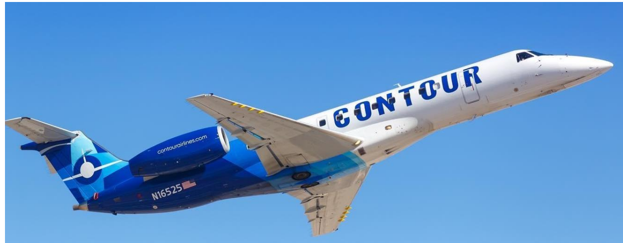
Embraer ERJ Aircraft

Contour Exclusively Operates Twin-Engine Regional Jet Aircraft in Our Essential Air Service (EAS) Network